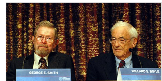
The charge-coupled device was invented by George E. Smith and Willard Boyle.