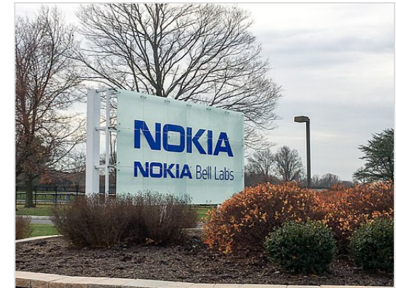
The entrance sign to Nokia Bell Labs at the company's headquarters in New Jersey from 2016 to 2022