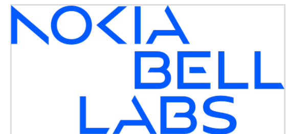
Logo of Bell Labs since 2023