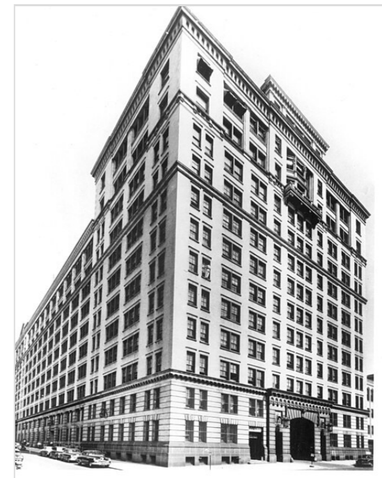
The Bell Laboratories Building , built at 463 West Street in New York City in 1925