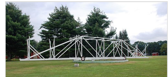
Reconstruction of the directional antenna used in the discovery of radio emission of extraterrestrial origin by Karl Guthe Jansky at Bell Telephone Laboratories in 1932