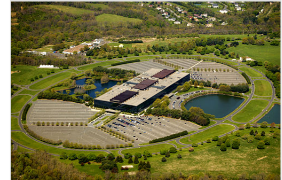
The Old Bell Labs Holmdel Complex, located about 20 miles south of New York City, in New Jersey

Bell's Holmdel research and development lab, a 1,900,000-square-foot (180,000 m 2 ) structure set on 473 acres (191 ha), was closed in 2007. The mirrored-glass building was designed by Eero Saarinen . In August 2013, Somerset Development bought the building, intending to redevelop it into a mixed commercial and residential project. A 2012 article expressed doubt on the success of the newly named Bell Works site, [20] but several large tenants had announced plans to move in through 2016 and 2017. [21][22]