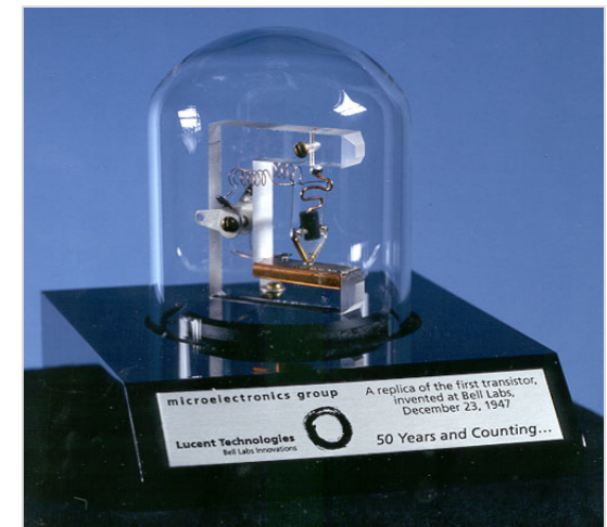
A replica of the first transistor, a point-contact germanium device, invented at Bell Laboratories in 1947

In 1958, a technical paper by Arthur Schawlow and Charles Hard Townes first described the laser .