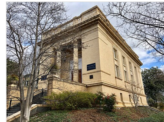
Bell's 1893 Volta Bureau building in Washington, D.C.

By the early 1940s, Bell Labs engineers and scientists had begun to move to other locations away from the congestion and environmental distractions of New York City, and in 1967 Bell Laboratories headquarters was officially relocated to Murray Hill, New Jersey .